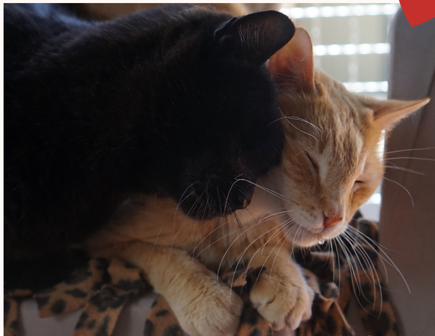
Twizzler (15) & Onyx (16)

Thank you for supporting our kitties, bonded pairs, and singletons.